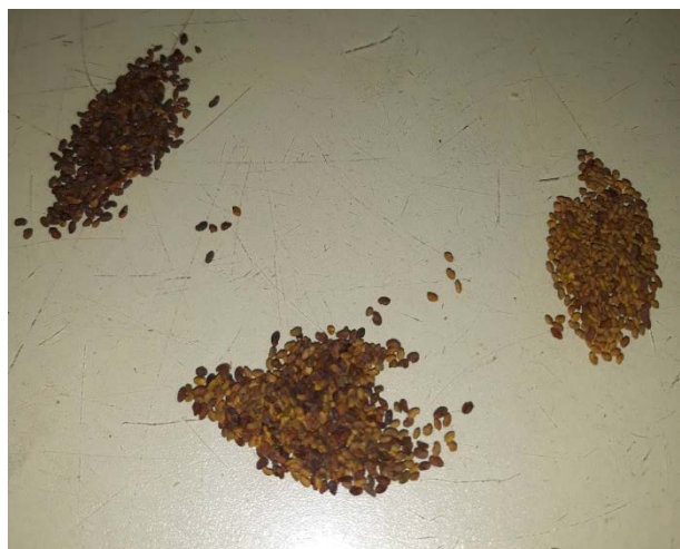
Fig 3. Alfalfa seed samples for the impurity analysis

analyzed (Figure 3) using an illuminated magnifying glass and a precision electronic scale for the sample mass measurement.