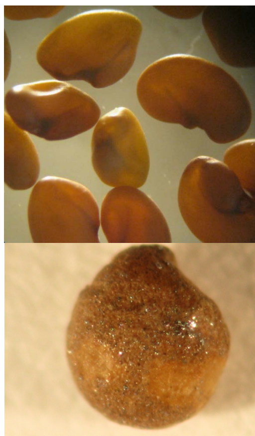
Fig. 2. Good seeds of alfalfa and Cuscuta sp seeds with the steel powder

The magnetic separator is fitted with three apertures for waste. The quantity and quality of seeds with admixtures were determined for all three apertures. The seeds from the first and second aperture can be reprocessed provided the weed content is low. In the case of the seeds from the third aperture, only the mass of the seeds was recorded in order to determine the total losses during processing. The seeds from the third aperture contained a large amount of weeds and admixtures, thus went to waste.