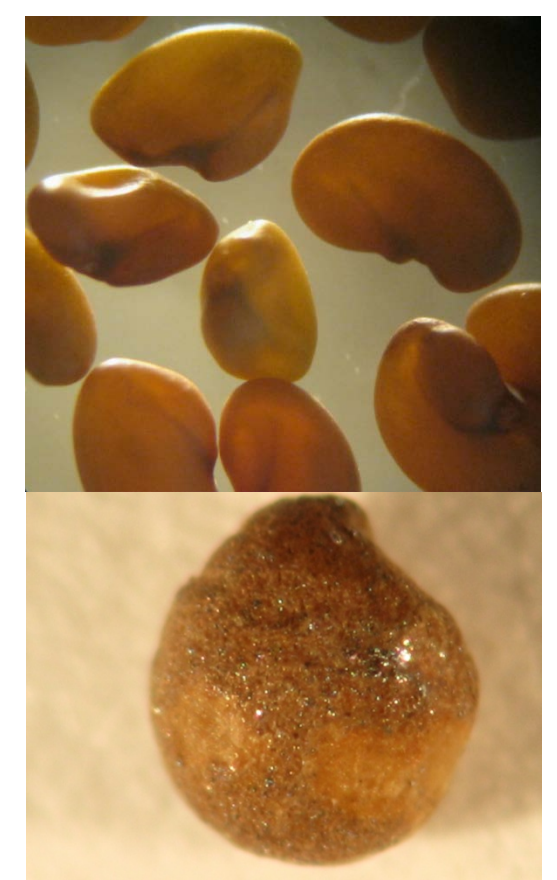
Fig. 2. Good seeds of alfalfa and Cuscuta sp seeds with the steel powder

The magnetic separator is fitted with three apertures for waste. The quantity and quality of seeds with admixtures were determined for all three apertures. The seeds from the first and second aperture can be reprocessed provided the weed content is low. In the case of the seeds from the third aperture, only the mass of the seeds was recorded in order to determine the total losses during processing. The seeds from the third aperture contained a large amount of weeds and admixtures, thus went to waste.