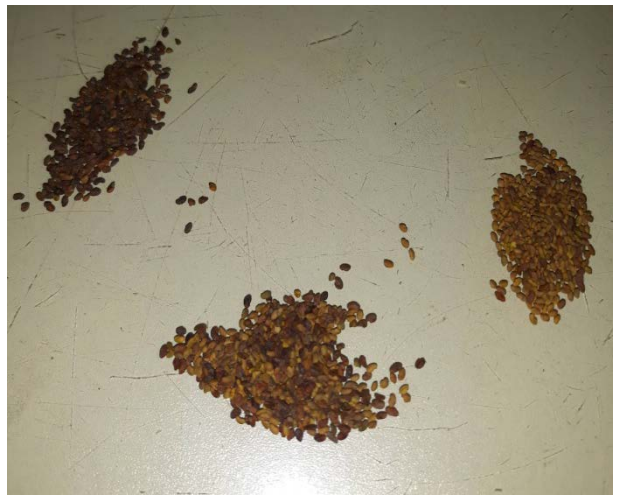
Fig 3. Alfalfa seed samples for the impurity analysis

analyzed (Figure 3) using an illuminated magnifying glass and a precision electronic scale for the sample mass measurement.