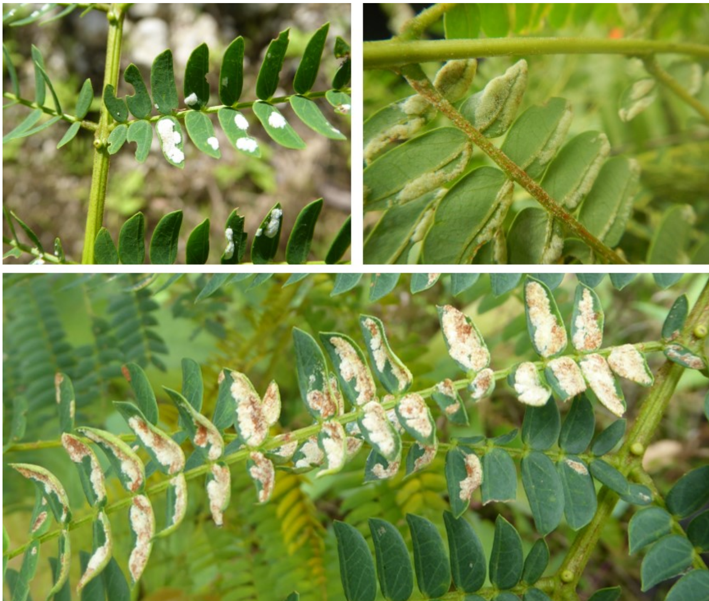
Figure 3 Symptoms of Solenidiversum falcatariae sp. nov. on Falcataria moluccana , erineum on the both surface of leaf.