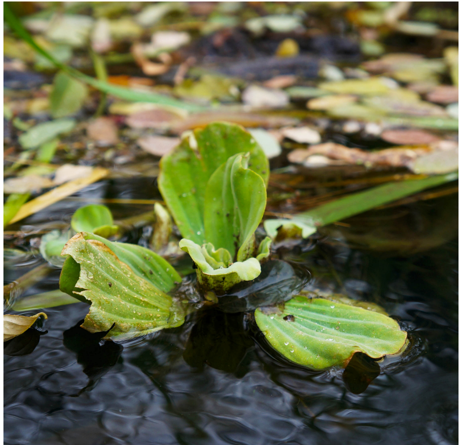
Figure 2. Pistia stratiotes in the water of Plovni Begej river in Srpski Itebej on November 8, 2017.

finding, field research was repeated in November 2017, with the aim of reassessing the situation in the field and collecting additional samples of P. stratiotes . Research was conducted upstream of a weir located in Srpski Itebej, on a 500 m long river transect, along which the environmental parameters were also recorded, following River Habitat Survey (RHS) methodology (Raven et al. 1997). Sampling of P. stratiotes was conducted from the boat. The collected samples were photographed (Figure 2) with a Sony NEX 5R camera and their exact GPS coordinates recorded (Supplementary material Table S1). The samples were stored in 70% ethanol and transferred to the laboratory of the Department of Biology and Ecology of the Faculty of Sciences, University of Novi Sad. One sample of P. stratiotes was deposited in the collection of the Herbarium of the Department of Biology and Ecology Faculty of Sciences, University of Novi Sad (BUNS Herbarium, accession number: 2-1515), while the others have been preserved in 70% ethanol. The identity of P. stratiotes (Figure 3) was subsequently confirmed using the standard plant identification keys (Cook 1990).