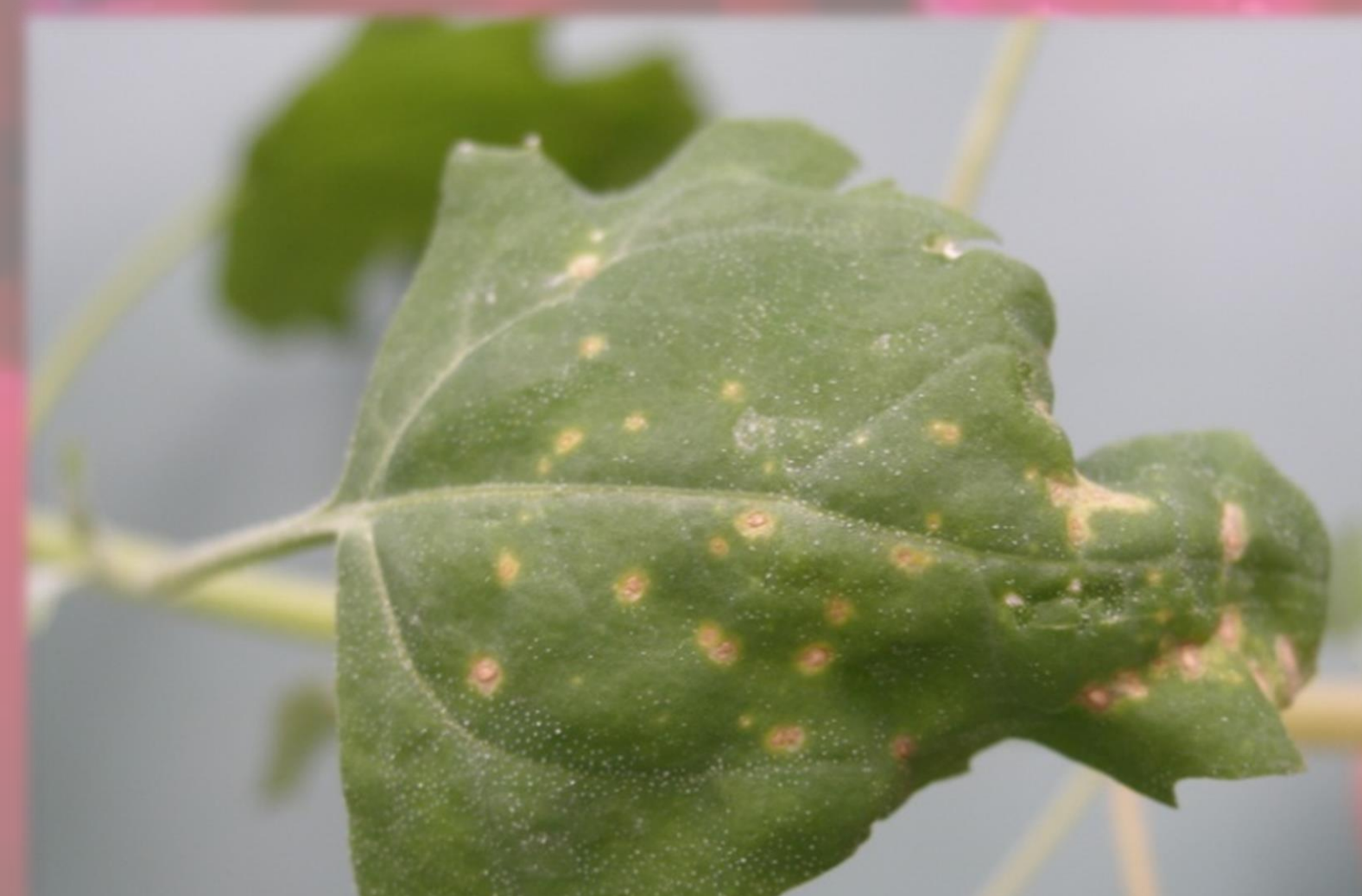
Chlorotic local lesions on Ch. quinoa