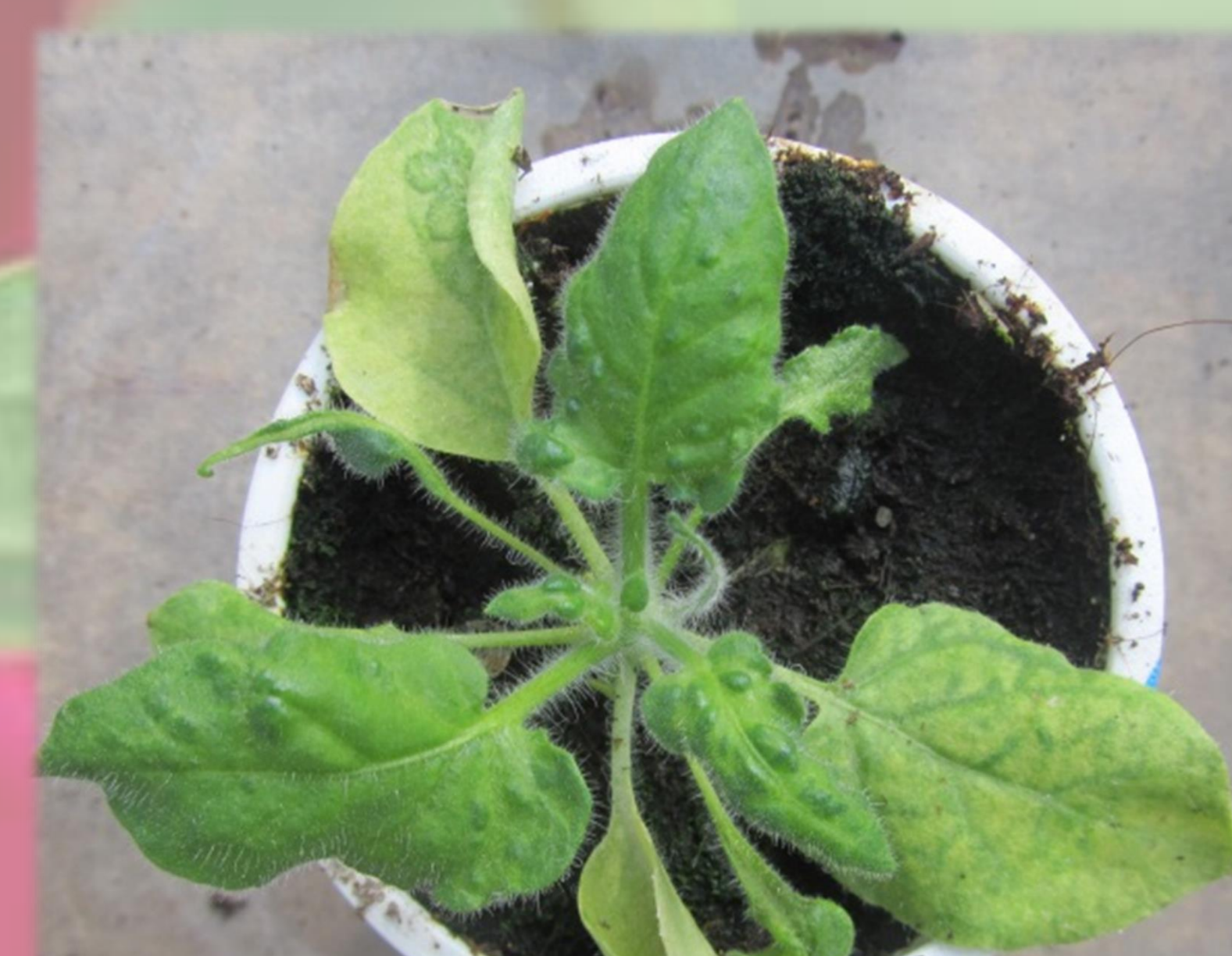
Severe mosaic and leaf malformations on N. glutinosa