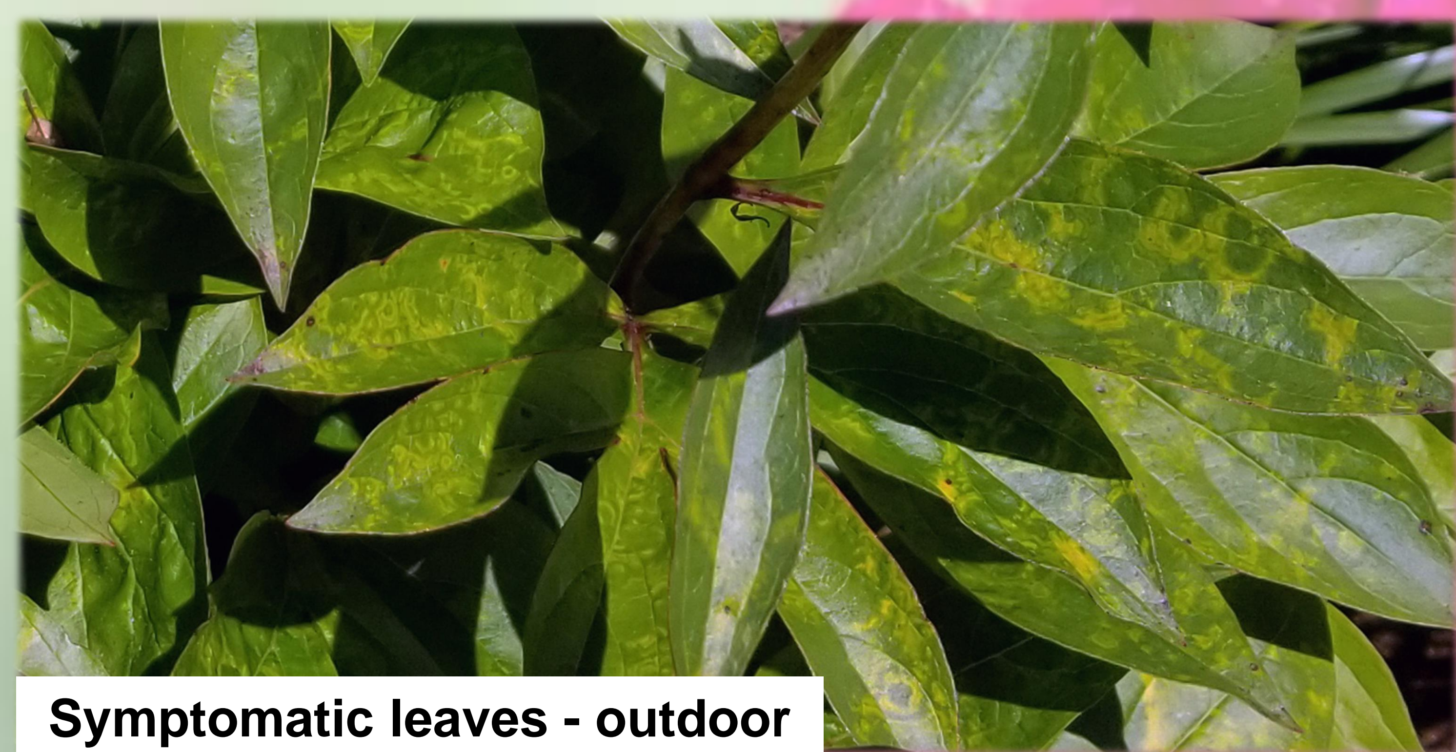
Symptomatic leaves - outdoor

Paeonia hybrida (family: Paeoniaceae), the garden peony, is a flowering plant known for its large, showy flowers and is often grown in many home gardens.