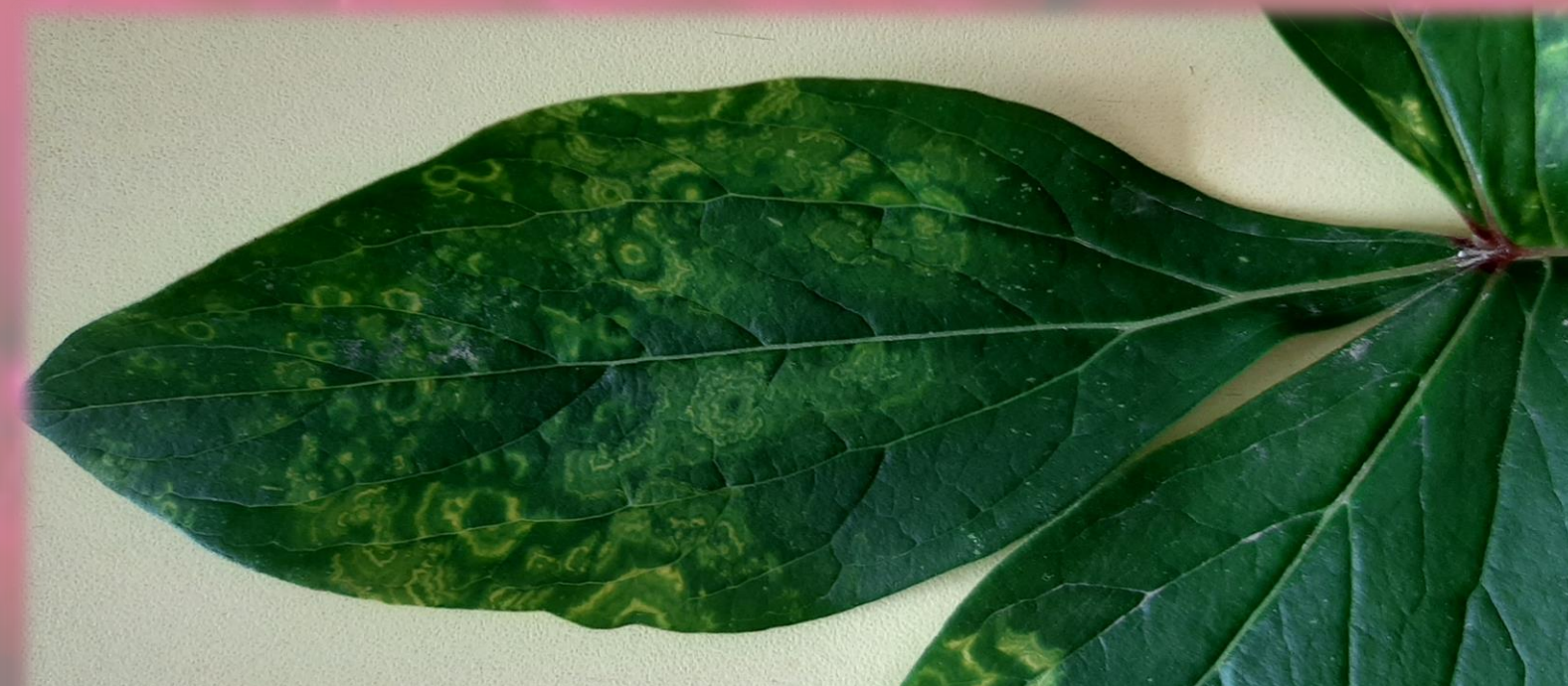
Symptomatic leaves - detail