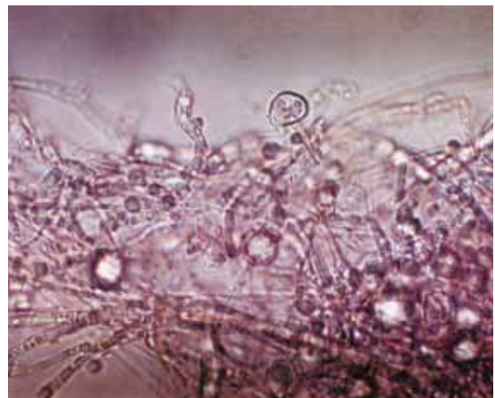
Figure 2. Fusarium oxysporum (LM 400X)