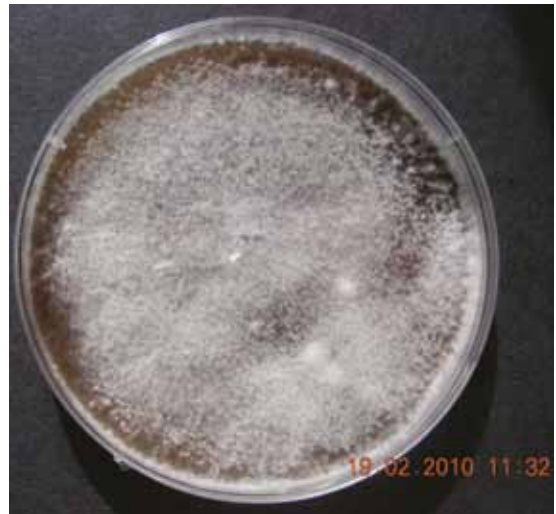
Figure 1. Mycelium of Fusarium oxysporum (PDA)

Fusarium is a large genus of filamentous fungi widely distributed in soil and in association with plants (Ohara et al., 2004).