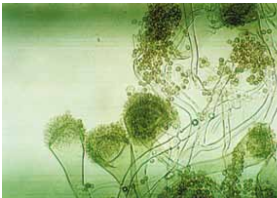
Figure 8. Aspergillus fumigatus (LM 400X)

Botrytis cinerea causes infections characterized by rapid destruction (maceration, necrosis) of the tissues of its plant host as it colonizes it (necrotrophy).