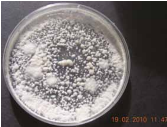
Figure 9. Mycelium of Geotrichum candidum (PDA)

(Gente et al., 2006). Mycelium of Geotrichum candidum on PDA and under a light microscope (LM) are shown in figures 9 and 10 respectively.