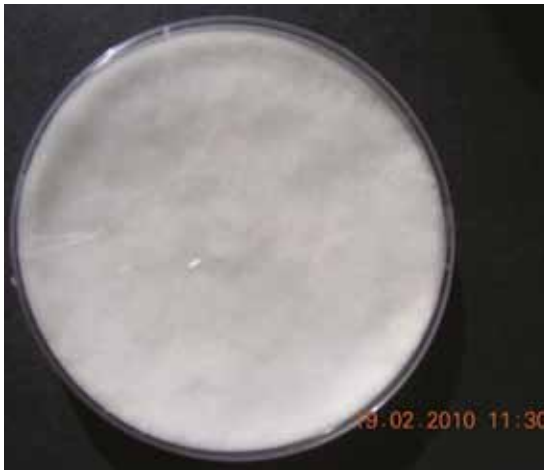
Figure 3. Mycelium of Oxyporus latemarginatus (PDA)