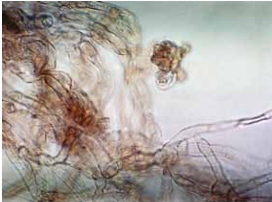
Figure 6. Botrytis cinerea (LM 400X)