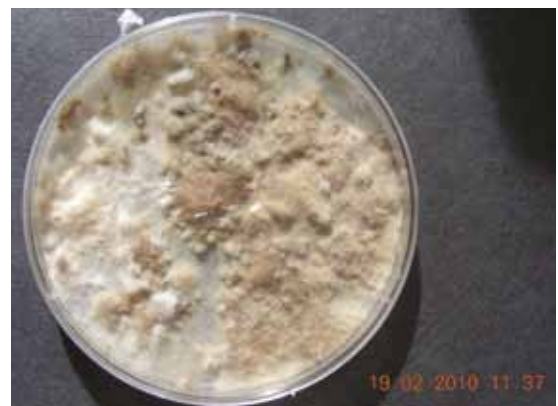
Figure 5. Mycelium of Botrytis cinerea (PDA)

Botrytis cinerea has a worldwide distribution but occurs mainly in humid temperate and subtropical regions; it is very common in the phylloplane of plants but does not attack healthy leaves; it can be facultative parasite on a wide range of plants causing blight or rot of leaves, flowers and fruits, the so-called gray mold (Domsch et al., 1980).