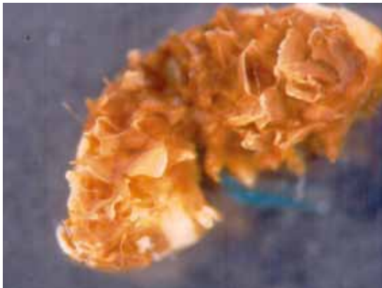
Figure 4. Oxyporus latemarginatus (Di 13X)

Many F. oxysporum isolates appear to be host specific, which has resulted in the subdivision of the species into formae speciales and races that reflect the apparent plant pathogenic specialization. Fusarium oxysporum and its various formae speciales have been characterized as causing the following symptoms: vascular wilt, yellows, corm rot, root rot, damping-off etc. (Kim et al., 2002). In solid media culture, such as potato dextrose agar (PDA), different special forms of F. oxysporum can have varying appearances. On PDA, growth is rapid and the white aerial mycelium may become tinged with purple or be submerged by the blue color of the sclerotia or by the cream to tan to orange sporodochia when they are abundant (Nelson et al., 1983; Leslie and Summerell, 2006). Fusarium oxysporum produces three types of asexual spores: microconidia, macroconidia, and chlamydospores (Ruiz-Roldan et al., 2010). Mycelium of Fusarium oxysporum on PDA and under a light microscope (LM) are shown in figures 1 and 2 respectively.