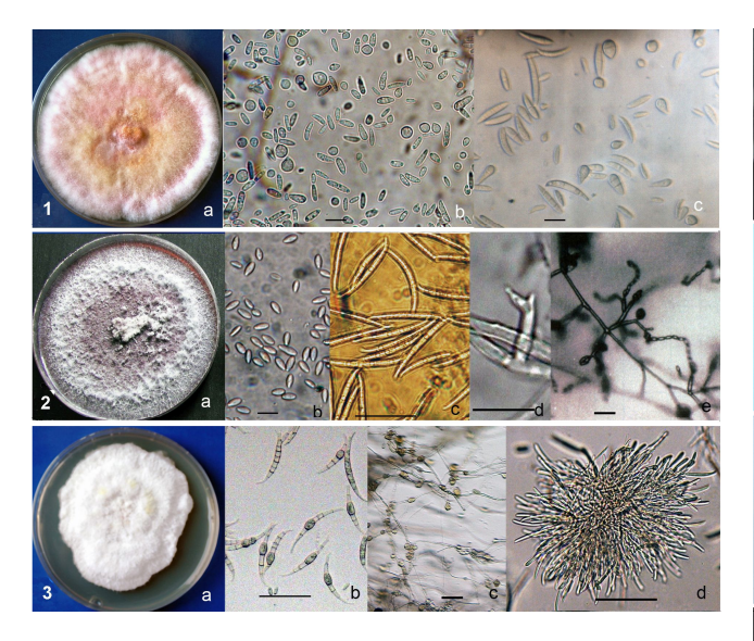
Fig. 1. Morphological characters of Fusarium isolate: 1 = F. tricinctum : a - colony on PDA, b - microconidia, bar - 10 µm, c micro and macroconidia, bar -20 µm, 2 = F.proliferatum: a - colony on PDA, b - microconidia, bar - 20 µm, c - macroconidia, bar - 50 µm, d) polyphialides in sity , bar - 20 µm, e) microconidia in chains and false heads on conidiophores in sity , bar - 20 µm, 3 = F. equiseti: a - colony grown on PDA, b - macroconidia, bar - 50µm, c chlamydospores in sity , bar - 40 µm, d) conidiogenous cells, bar - 50 µm

+ = Presence; - = absence; Cr = crecent; Lc = long chains; El = ellipsoidal; Fh = false heads; Np = napiform; Ov = ovoid; Ol = oval; Py = pyriform; PSr = sp