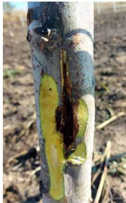
Figure 2. Xanthomonas arboricola pv. juglandis . VOC symptom: bark cracking and necrosis of internal tissues