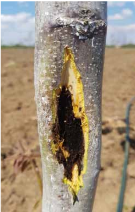
Figure 3. Xanthomonas arboricola pv. juglandis . VOC symptom: deep internal necrosis and trunk deformation