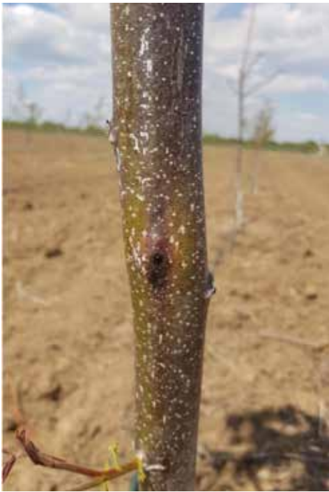
Figure 1. Xanthomonas arboricola pv. juglandis . VOC symptom: canker formation and bark staining