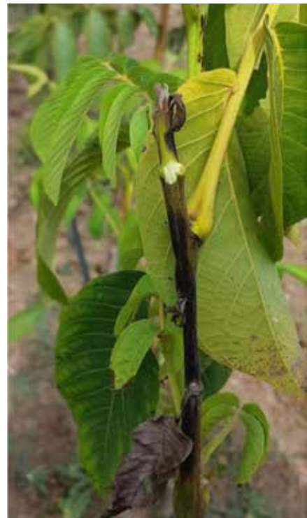
Figure 4. Xanthomonas arboricola pv. juglandis . WBB symptom on shoots