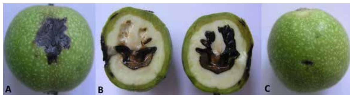
Figure 5. Xanthomonas arboricola pv. juglandis – pathogenicity on immature walnut fruits. A: symptoms noted 7 days after inoculation; B: fruit cross-section 14 days after inoculation; D: control fruit treated with SDW

Inoculation of immature walnut fruits (cv. Chandler) resulted in brown lesions, which were observed on the inoculation sites seven days after inoculation in the case of X. a. pv. juglandis isolates (Figure 5A). After 14 days, lesions expanded and progressed under the pits, and tissue necrosis occurred (Figure 5B). Similar symptoms were observed in two B. rubrifaciens tested isolates (Figure 6A). Negative controls were symptomless (Figures 5C and 6B).