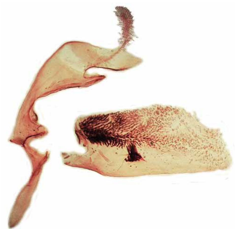
Picture 2 - Dipchasphecia chitrata sp. n., male genitalia: uncus-tegumen with aedeagus (left), valva (right).