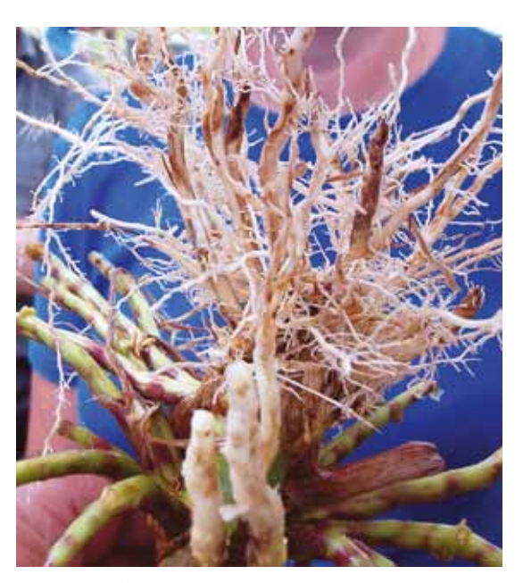
Figure 5. Feeding scars on corn root