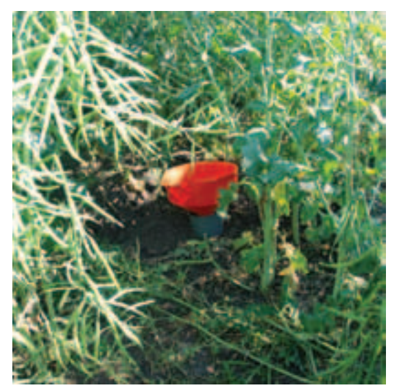
Figure 1. A funnel trap used to monitor the time when larvae leave pods and go into soil

D. brassicae midges developed two generations per year on the trial site and overwintered in the larval stage in cocoons in soil, as they do in most other European countries (Williams et al., 1987; Ferguson et al., 2004;