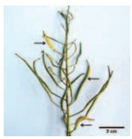
Figure 4. Damaged pods of oilseed rape change their colour, often deforming, drying and cracking

During our examination of infested pods, special attention was paid to detecting damage caused by the cabbage pod weevil Ceutorhynchus assimilis , (syn. C. obstrictus ), which is important for infestation intensity of D. brassicae . In this study, damage caused by that weevil species was not observed. A single larva of C. assimilis was found in the total of 773 examined pods, so the correlation between these two species was not determined. Similar observations had been reported in the Czech Republic (Kazda et al., 2005), while other literature data show that the midge uses openings made by C. assimilis for oviposition (Åhman, 1987; Pavela et al., 2007; Aljmli, 2007; Williams, 2010).