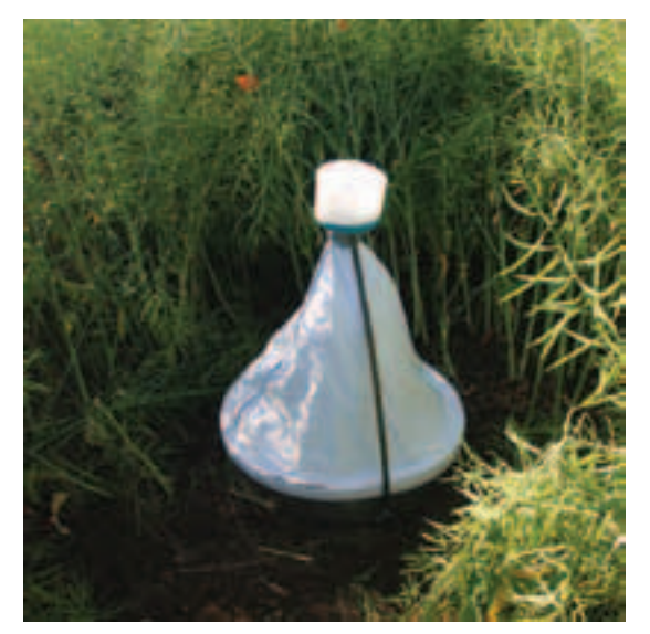
Figure 2. An emergence trap used to monitor the emergence of D. brassicae from the ground