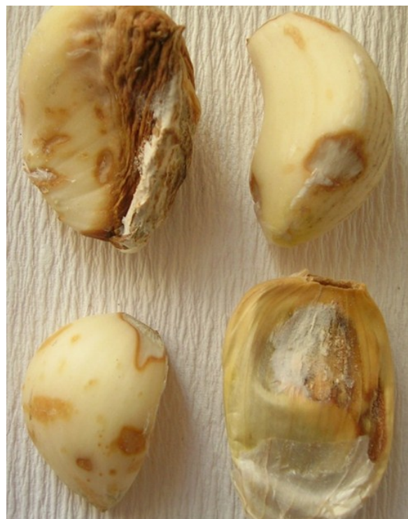
Figure 1. Symptoms of garlic cloves rot

Collected diseased garlic cloves showed visible symptoms as dark lesions usually covered with white mycelium followed by necrosis and drying (Fig. 1). The macroscopic characteristics of colonies (colour and morphology of mycelium; pigmentation in agar) showed differences in appearances on PDA incubated at 25°C, creating three morphologically distinct groups (Type I, Type II and Type III) (Fig. 2). Two isolates (B5, JBL535) with salmon orange pigmentation in agar, and white to light rose fluffy mycelium are classified into a morphological group marked as Type I. Four isolates (B3, BL8, BL9, and JBL531) that produced yellow to light brown pigments mainly in the centre of the colony covered with cotton white, rich mycelium were assigned as Type II. Seven isolated strains (BL1, BL2, BL11, BL15, JBL532, JBL537, JBL6) characterized by white fast growing mycelia and dark violet pigments in medium belonged to a morphological group designated as Type III. The colonies of isolates from group Type II and III were rapidly growing and reached 7-8.5 cm diameter for 7 days at 25°C on PDA, and isolates of group designated as Type I formed colonies of 6.8-7.5 cm in average for 7 days at 25°C.